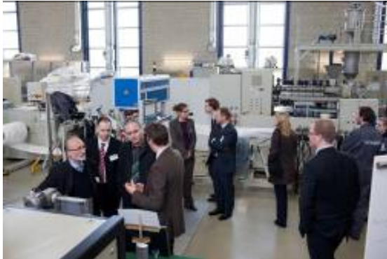
Visiting the development plants at IKV location Campus Melaten

these live demonstrations helped to answer any questions that still remained unresolved, thereby rounding off the Colloquium.