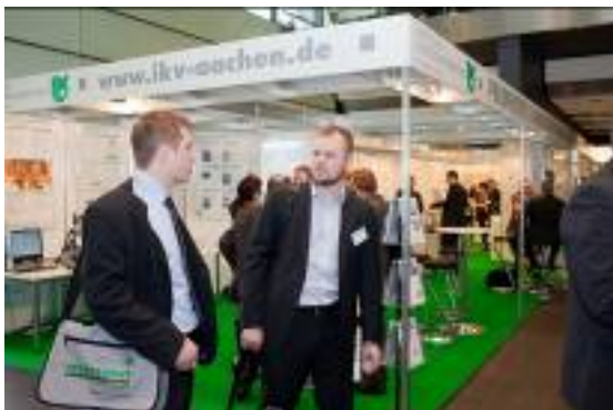
Specialist exhibition with 40 exhibitors

Colloquium. To mark the 60 th anniversary of the IKV and its Colloquium, products and services from the fields of systems technology, peripherals technology and process technology were presented, together with innovative engineering services, quality control systems, and laboratory and analysis units for the plastics and rubber industry. Participants rated the contacts, the interest shown in their exhibits and the contents of the talks they conducted as good and promising, and similarly praised the outstanding organisation. The current exhibitor catalogue and a list of the participating companies will be available on the Colloquium website at www.ikv-kolloquium.de for some time still.