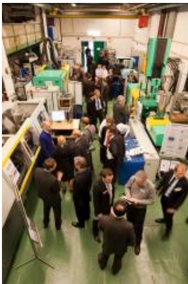
Visiting the Injection Moulding development plant at IKV's Pontstraße building

The IKV would like to thank all those who were actively involved in the 25 th IKV International Plastics Technology Colloquium, and all those who attended, for their commitment and the many ideas they came up with in individual talks and in discussion contributions. In the same way, the IKV would like to thank the companies of its Association of Sponsors and the agencies distributing funds from the public purse for their support of the research work that has been presented.