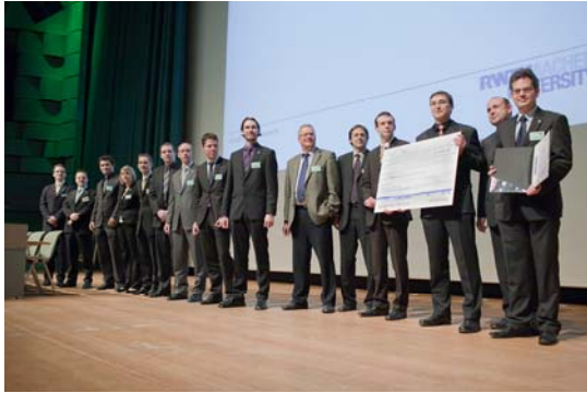
Prize Winner of the Young Researcher Award 2009