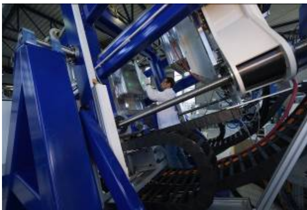
Gap impregnation unit installed in the FRP pilot plant at IKV

In the Composites Department, the series production processes for thermoset FRP constituted a particular highlight. The gap impregnation process met with a great deal of interest here – this was awarded the AVK's innovation prize for the university sector in 2009 (see IKV Communications 3/2009 and 4/2009) – as did new simulation tools and the fibre spraying of thermoplastic hybrid yarns.