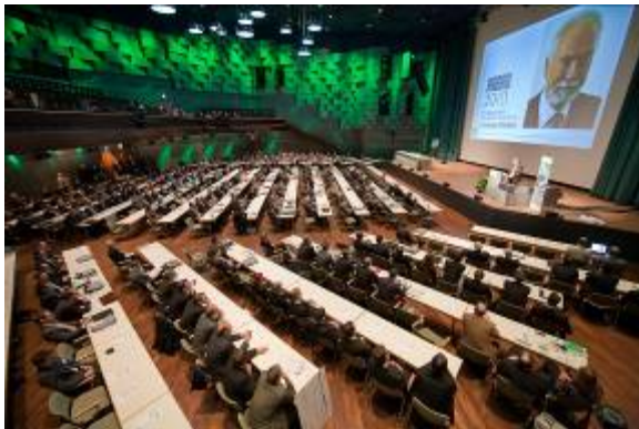
500 participants attended the IKV Colloquium 2010

Aachen. The 25th International Plastics Technology Colloquium was held on 3 and 4 March 2010 in the Eurogress Aachen. With some 500 experts attending, the number of participants remained constant compared with 2008, despite the economic crisis. Participants represented the entire spectrum of the plastics industry and included raw materials manufacturers, machine and mould manufacturers and plastics processors plus their customers. Those taking part in Aachen came from 15 countries and more than 250 companies and institutions.